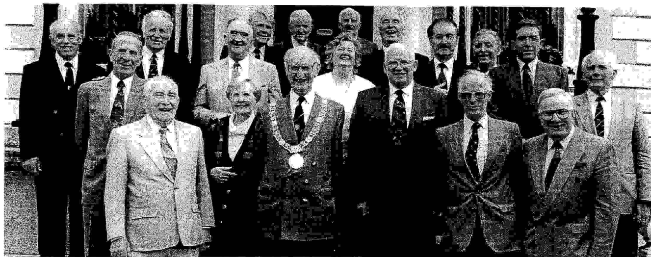
The founding members of ARCO pose for a picture at a Mayoral reception at the Mansion House in June 1994.

A PUBLIC awareness survey of the Association of Retired Commissioned Officers (ARCO) might establish that we have a low profile, with perhaps some negative views of our role and objectives. This is a matter of concern for us, and we would like to develop a more enlightened perception of who we are, our aims, and the degree to which we have succeeded to date.