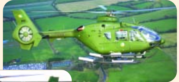
EC 135P 2 Light Utility Heli.

Due to the aircraft's recent design it complies with all latest safety and regulatory standards and provides the Air Corps with a significant increase in capability. In normal mission roles it will support the Defence Forces for troop transport and provides for a 10-troop seat configuration as standard and a 12 utility seat configuration when required. The troop arrangement is based on tactical troop seats arranged back to back along the longitudinal axis of the aircraft with provision for two tactical gunners if required in the forward position. There is a large sliding door on each side of the cabin that facilitates troop ingress and egress and also allows for ease of entry with equipment. A large 3.4m 3 storage space is accessible