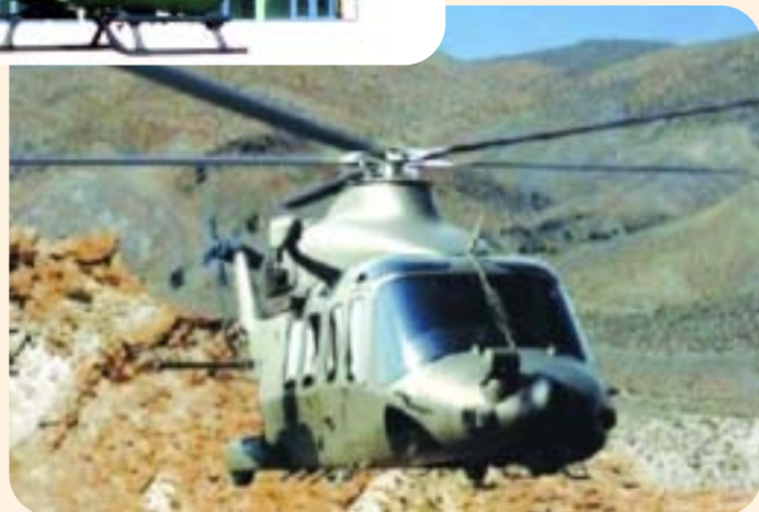
Agusta Westland AW 139

from the rear of the cabin and provides a convenient place for mission specific equipment.